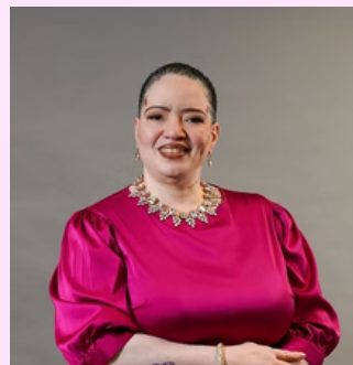
Executive Director, Beautifully Unblemished Vitiligo Support Group